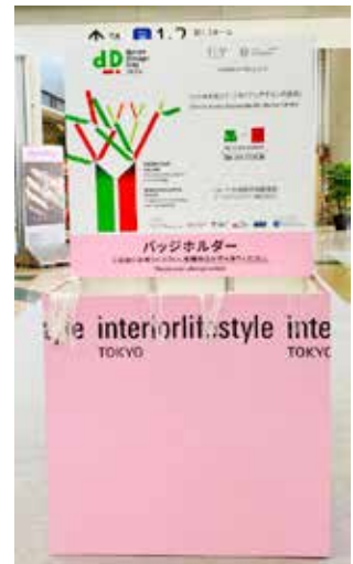
Badge Holder Box Image

*The number of this tool will be limited to two and will be allocated on a first-come, first-served basis. *Please indicate "Exhibitor's name for public use" and "Booth number" in the ad space. *Submission data: All data must be outline-formatted Illustrator files (CS5 or lower /W1,090 × H850 (mm) / 350dpi or higher).