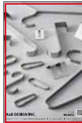
Back cover / Inside back cover / 1 page

*The data submission details will be e-mailed to applicants.