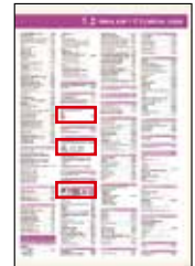
Logo in the exhibitor list